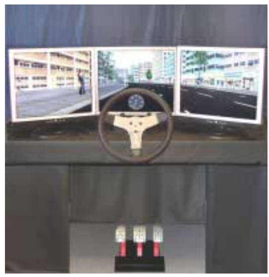
XP-300 with 3 channels and improved controls

XP-300 brings a new dimension to road safety and hazard perception training.